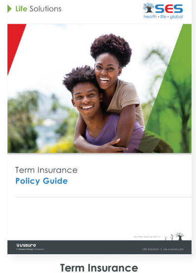
My Term Insurance Policy Guides Us Solver | Servicus Son